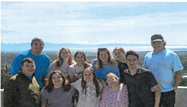
Team assisting church starts and prayerwalking University campuses in Canada in May