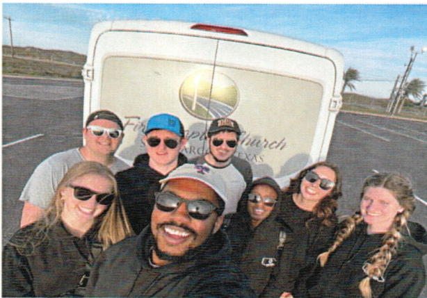
Team at Beach Reach, South Padre Island, March

Above: This group played volleyball for 10 straight hours to raise money to send student missionaries! Texas State BSM students served as missionaries over the past year at Beach Reach and in British Columbia. We are preparing to send a team to Mission Arlington this December and on 2 more trips in the spring. An additional 13 students are applying to be Texas BSM missionaries over the Christmas break and others will go in the summer! It is exciting to send students and see the impact they make and the growth that takes place in their lives as they serve!